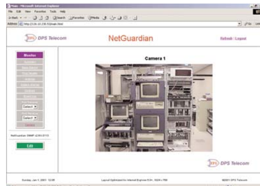
Figure 2 - View live streaming video of your remote sites and equipment with the touch of a button.

Downtime of revenue-generating equipment is not always caused by equipment malfunction. In fact, behind planned downtime and application failures, people are the leading cause of network downtime. A complete network alarm management system requires more than just environmental and equipment monitoring. Security issues and personnel must be factored in to see the complete picture. When an alarm occurs, quick notification and response time