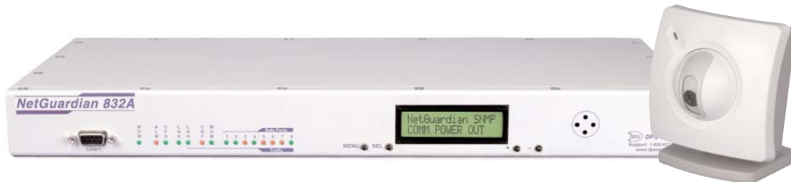
Figure 1 - Net Guardian 832A monitors alarms, pings network elements, acts as a terminal server, reports via SNMP or pager, and provides live streaming video of remote sites.