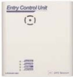
Entry Control Unit