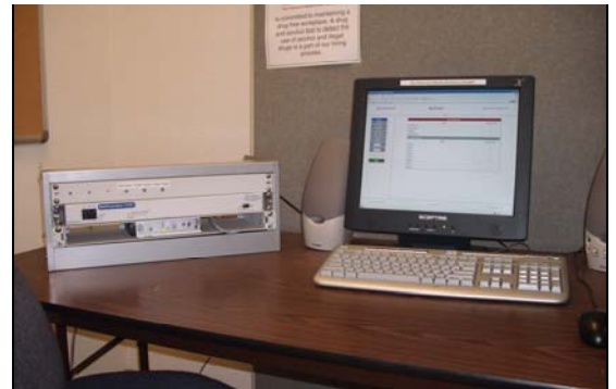
DPS Telecom's Testing Kiosk

Our interview process varies from position to position. Applicants may expect interviews via phone, and one-on-one with the hiring manager and the department manager. Applicants can expect to have anywhere from one to 3 meetings with department representatives.