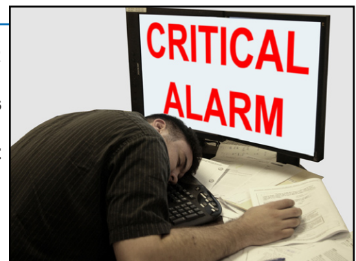
Frequent nuisance alarms chip away at your staff's attention, eating up their available time and increasing the chance of missing an important alert.

How much could you reduce the workload for your operators and dispatchers with an intelligent alarm filtering system that eliminated unimportant alerts?